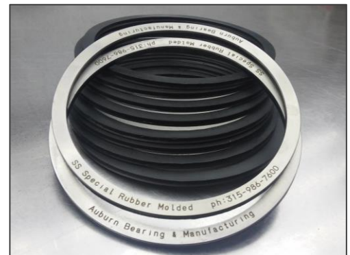
Stainless Steel Rings with Bonded Rubber