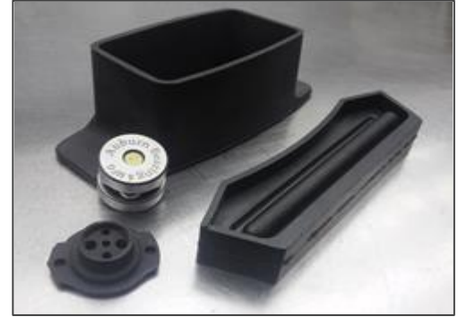
Special Molded Rubber Parts