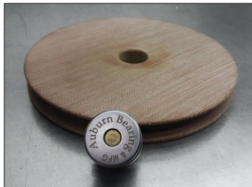
Custom Phenolic Pulley

Aluminum, Brass, Bronze, Carbon & Alloy Steels, Stainless Steels, Machinable Plastics, & Specialty Materials