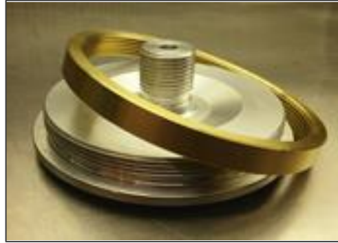
Oil Filter Adapter for Antique Car